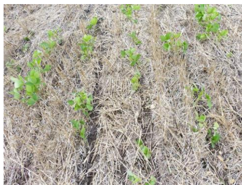
Foto 1. Campo con escasa emergencia de plantas de soja causado por Pythium aphanidermatum .

Photo 1. Field shows scarce soybean seedling emergence caused by Pythium aphanidermatum .