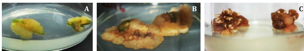
A) proliferation of translucent, whitish and spongy callus in explants with 1.0 \text{ mg L}^{-1} 2,4-D + 0.5 \text{ mg L}^{-1} BAP; B) change in callus coloration, white to brown and/or brownish; C) differentiation of the compact globular structure (proembryo) with 0.1 \text{ mg L}^{-1} 2,4-D + 0.5 \text{ mg L}^{-1} KIN.

Promedio \pm E.E; las letras en común significan que los valores no son estadísticamente diferentes p > 0,05 según la prueba de Duncan.